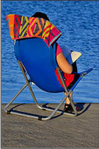
Apartment613's flickr pool