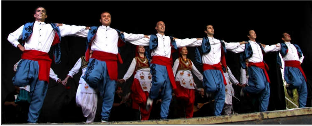
Youth Folk Dance and Music Ensemble Ministry of Culture and Tourism Republic of Turkey